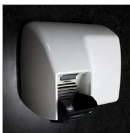
Flap directs air upward for face drying.