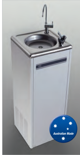
Zip Economaster is available in white or stainless steel case.

Zip Chillmaster – chilled filtered water instantly – free standing drinking water station with stainless steel case. Features choice of sub-micron or 5 micron filtration. Includes filter change reminder light.