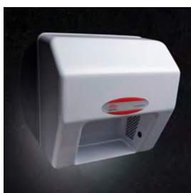
Zip Magic Eye "hands in" hand dryer