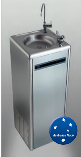
Zip Chillmaster has stainless steel case.